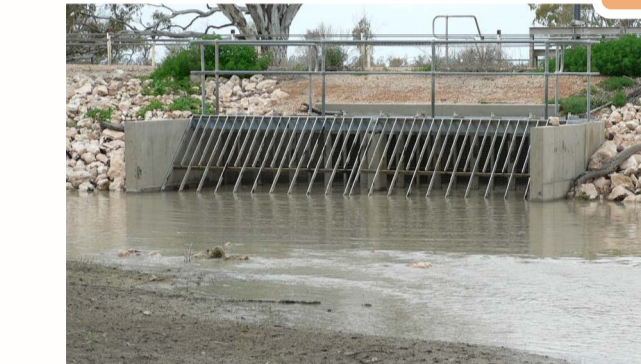
Indicative image of an open small regulator (Wallawalla Causeway, TLM)