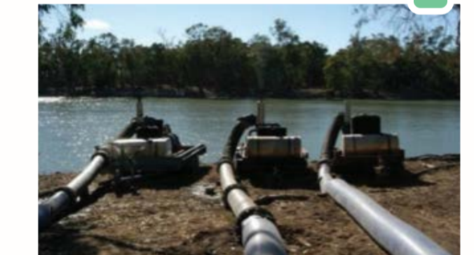
Indicative image of a designated crushed rock hardstand to support temporary pumping