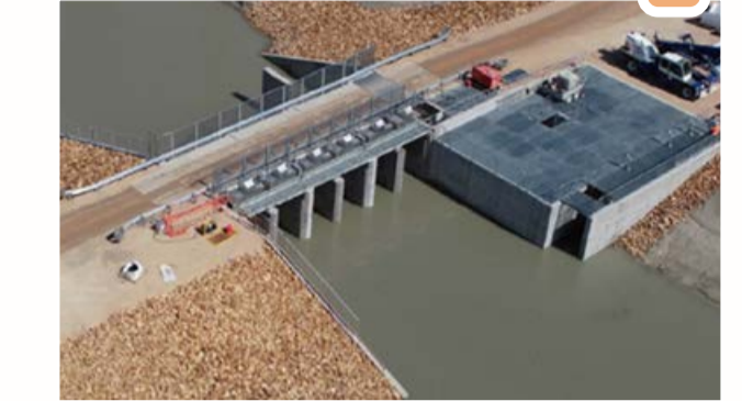
Indicative image of a very large regulator with fishway (Pike Floodplain, SA)