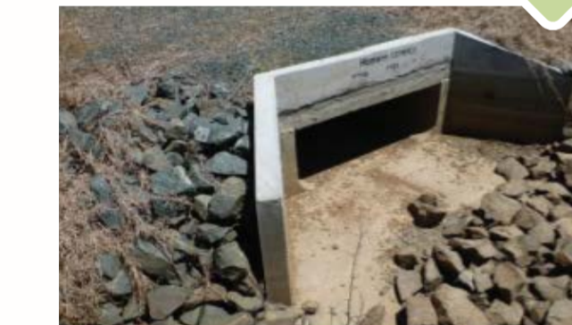
Indicative image of a box culvert (Hattah Lakes, TLM)