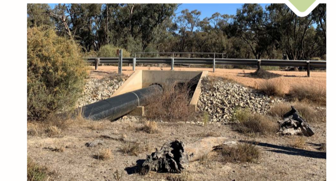
Indicative image of a pipe culvert