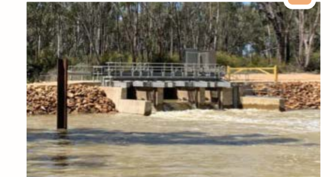
Indicative image of an open large regulator (Mularoo regulator, TLM)