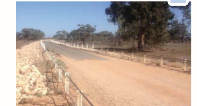
Indicative image spillway on a containment bank (Lake Wallawalla, Lindsay Island, TLM)