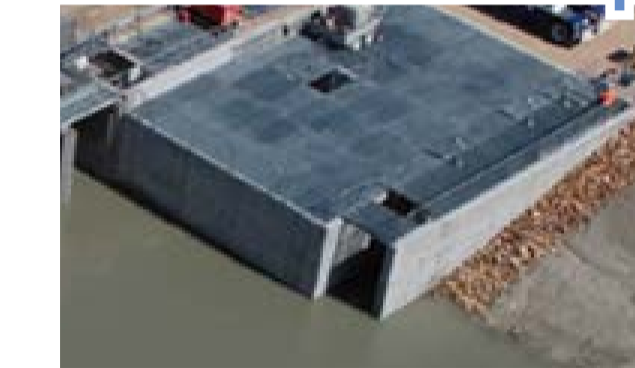
Indicative image of a fishway associated with a very large regulator located to the right