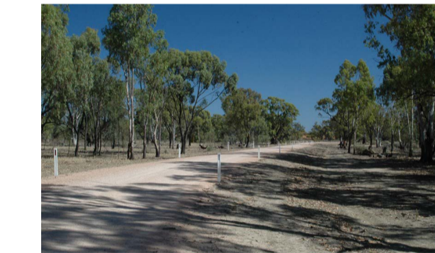
Indicative example of a containment bank with an access track (Hattah Lakes, TLM)