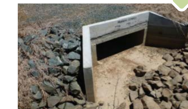
Indicative image of a box culvert (Hattah Lakes, TLM)