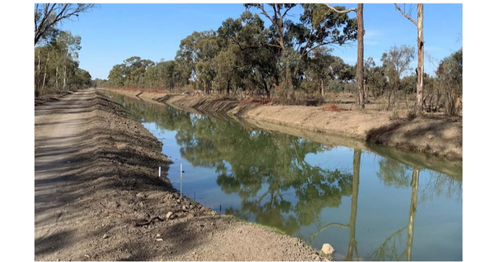
Indicative image of a channel