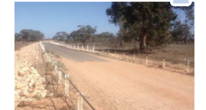
Indicative image spillway on a containment bank (Lake Wallawalla, Lindsay Island, TLM)