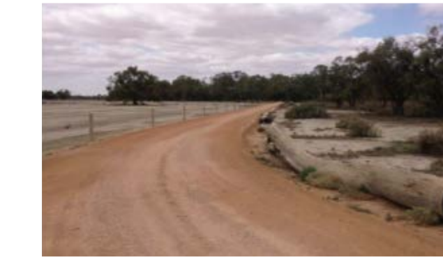
Indicative image of a track