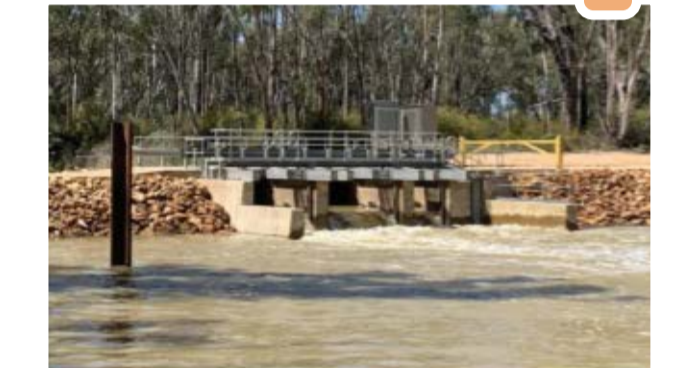
Indicative image of an open large regulator (Mullaroo regulator, TLM)