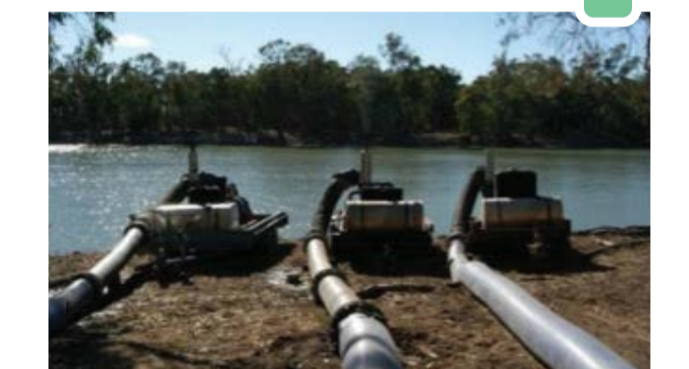
Indicative image of a designated crushed rock hardstands to support temporary pumping