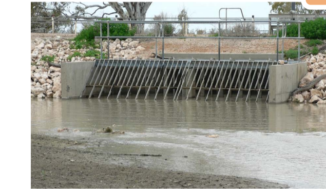
Indicative image of an open small regulator (Wallawalla Causeway, TLM)