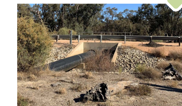
Indicative image of a pipe culvert