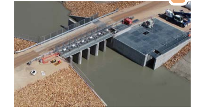
Indicative image of a very large regulator with fishway (Pike Floodplain, SA)