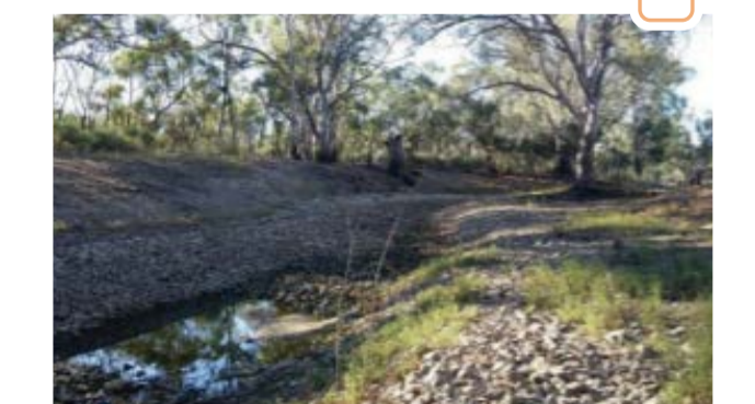
Indicative image of a drop structure