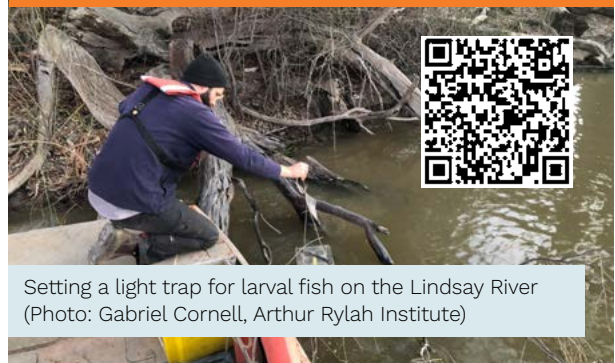
Setting a light trap for larval fish on the Lindsay River

Read more about the ecological monitoring at Guttrum and Benwell Forests and Gunbower National Park.