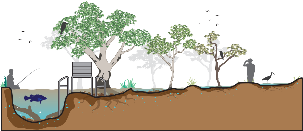
Scenario 1: Infrequently, when the river is high and flowing into the forest, and the water will stay on the floodplain for long enough, we will open the regulators and leave the water to flow naturally.