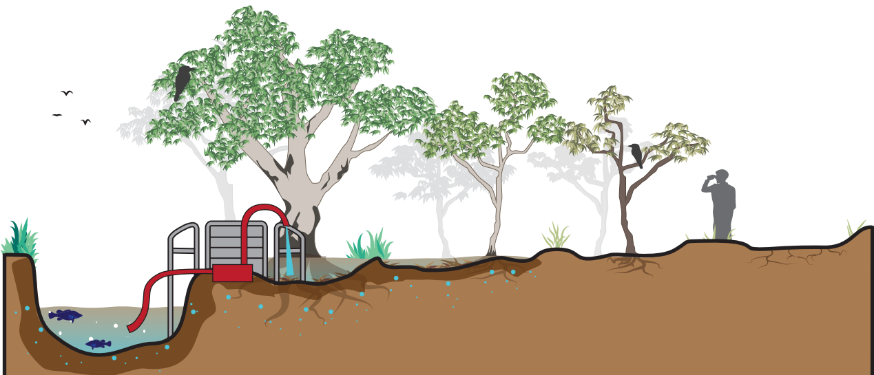
Scenario 3: If the floodplain is too dry, we can use a temporary pump to get environmental water onto the floodplain and close the regulators to hold the water there for as long as needed, before returning the water to the river.