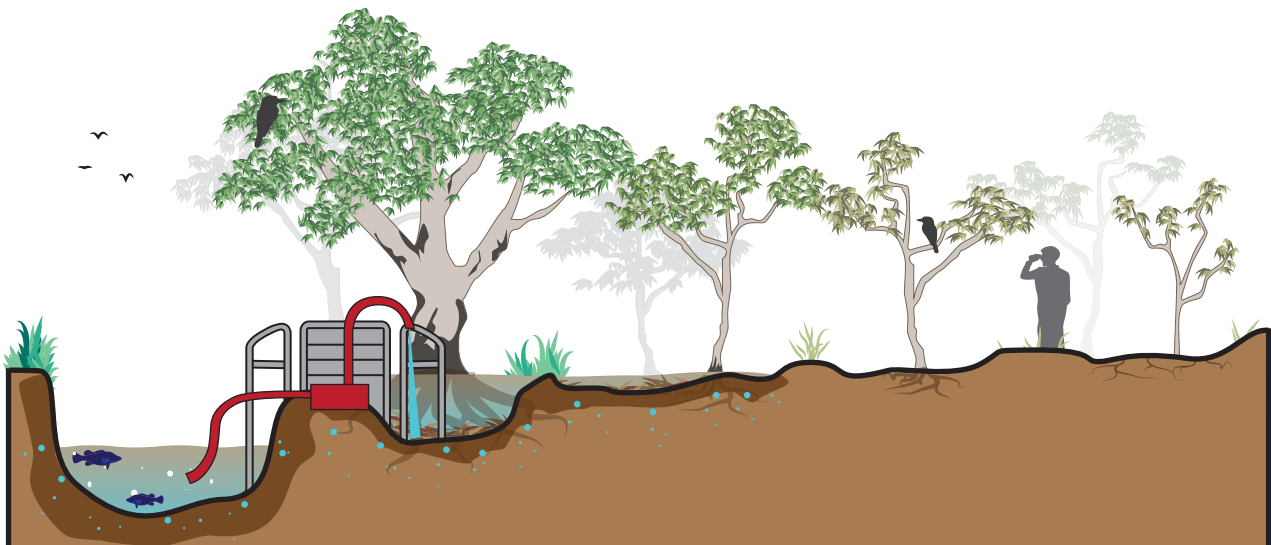
Scenario 3: If the floodplain is too dry, we can use a temporary pump to get environmental water onto the floodplain and close the regulators to hold the water there for as long as needed, before returning the water to the river.