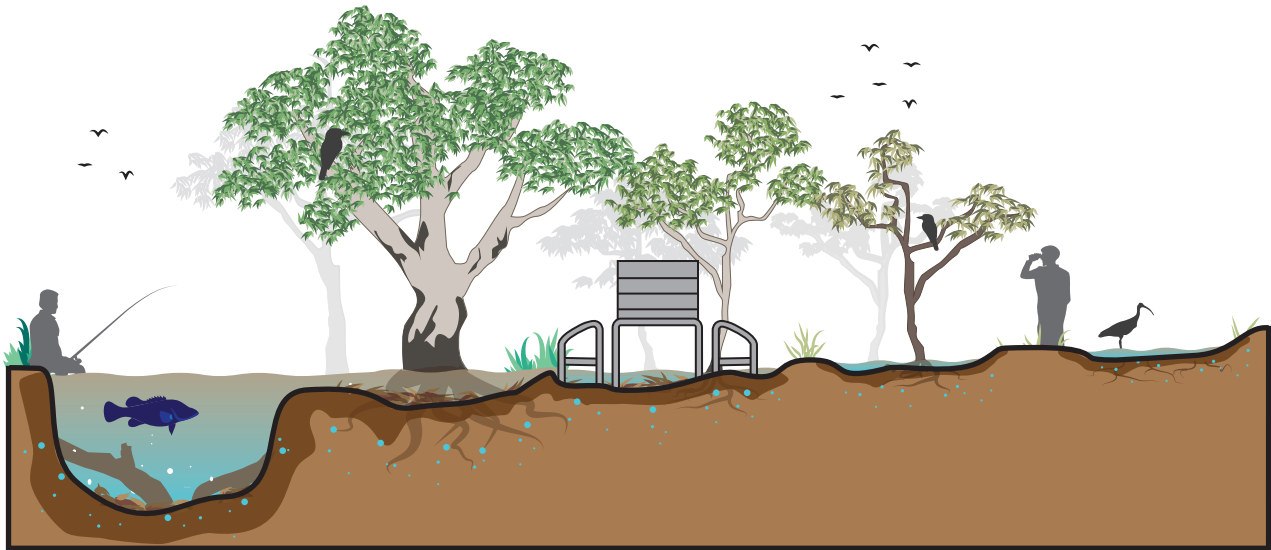
Scenario 1: Infrequently, when the river is high and flowing into the forest, and the water will stay on the floodplain for long enough, we will open the regulators and leave the water to flow naturally.