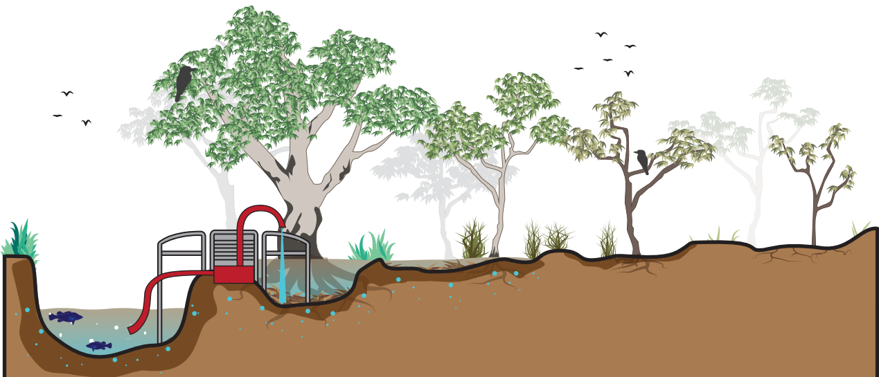
Scenario 3: If the floodplain is too dry, we can use a temporary pump to get environmental water onto the floodplain and close the regulators to hold the water there for as long as needed, before returning the water to the river.