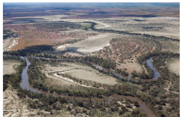
Wallpolla Is - Mallee CMA.

If you would like to know about the Victorian Murray Floodplain Restoration Project see our website www.vmfrp.com.au or please contact us at the Mallee Catchment Management Authority on 50514377 or email us at info@vmfrp.com.au