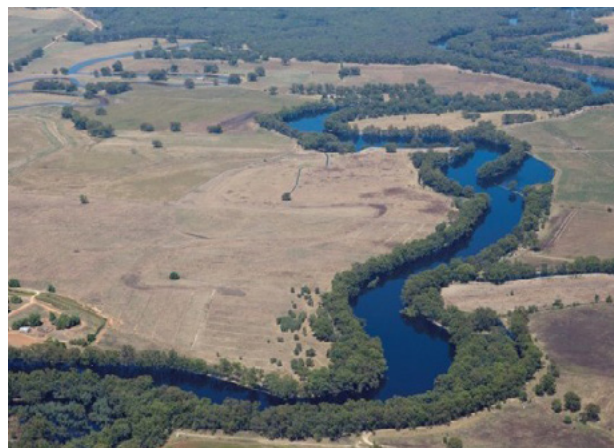
Vinifera Aerial - Mallee CMA

If you would like to know about the Victorian Murray Floodplain Restoration Project see our website www.vmfrp.com.au or please contact us at the Mallee Catchment Management Authority on 50514377 or email us at info@vmfrp.com.au