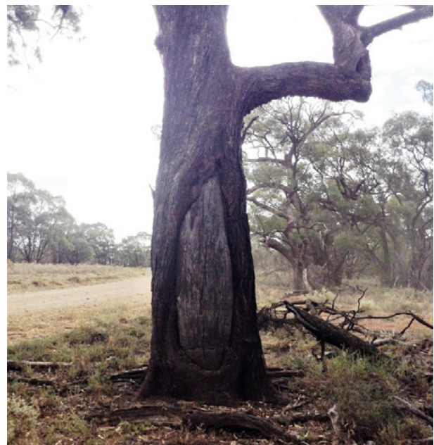
Scar Tree in Hattah - Mallee CMA

If you would like to know about the Victorian Murray Floodplain Restoration Project see our website www.vmfrp.com.au or please contact us at the Mallee Catchment Management Authority on 50514377 or email us at info@vmfrp.com.au