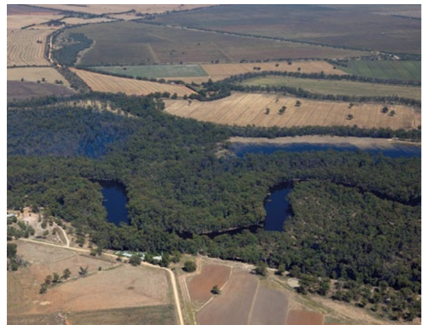
Burra Creek - Mallee CMA.

If you would like to know about the Victorian Murray Floodplain Restoration Project see our website www.vmfrp.com.au or please contact us at the Mallee Catchment Management Authority on 50514377 or email us at info@vmfrp.com.au